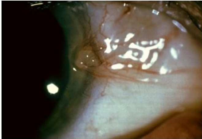
Figure 2: Pinguecula next to cornea.

A pinguecula is a small yellow growth on the white of the eye near the edge of the cornea, usually on the nasal (nose) side. However, a pinguecula does not actually grow onto the cornea such as a pterygium, and it is not a tumour. It is an alteration of normal tissue resulting in a deposit of protein and fat. It is a condition affecting particularly older people.